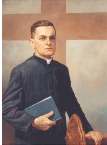
Father McGivney Pray for US

The deadline for material for publication in the Mariner is the Friday that follows the 3rd Wednesday of the prior month. PLEASE keep this deadline in mind for articles you wish to have publish in the Mariner.