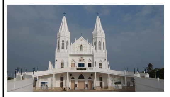
The Shrine of Our Lady of Good Health (Continued on page 4)

I do hope that you are having a nice summer vacation and after summer vacation, your children and grandchildren will be getting ready to go back to school. So, I will wish all the students—all your children and grandchildren who went to