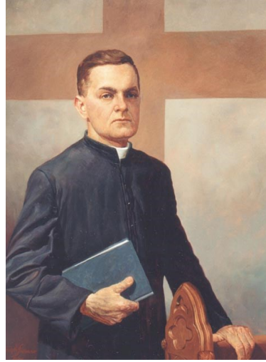
Father McGivney Pray for Us

Meetings are held on the 1st and 3rd Tuesdays of each month in the Council Hall located at the intersection of Morton Street and Garity Place. The mailing address is 1 Morton Street, Farmingdale, NY 11735-4340. The deadline for material for publication in the Mariner is the Friday that follows the 3rd Wednesday of the prior month. PLEASE keep this deadline in mind for articles you wish to have publish in the Mariner.