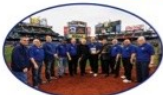
NYS Knights of Columbus receiving the Spirit Award 2019

Join us at Citifield on FRIDAY, MAY 28, 2021 AT 7:10 PM to watch the RIVALRY HEAT UP between the Braves & Mets