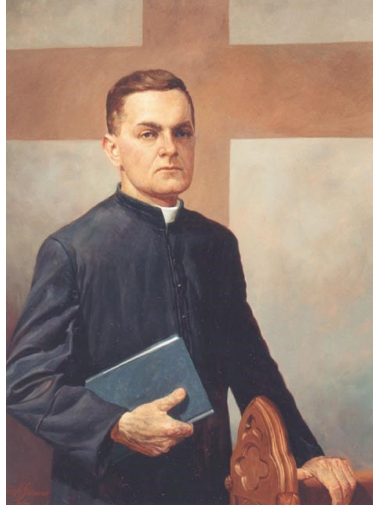
Father McGivney Pray for Us

Meetings are held on the 1st and 3rd Tuesdays of each month in the Council Hall located at the intersection of Morton Street and Garity Place. The mailing address is 1 Morton Street, Farmingdale, NY 11735-4340. The deadline for material for publication in the Mariner is the Friday that follows the 3rd Wednesday of the prior month. PLEASE keep this deadline in mind for articles you wish to have publish in the Mariner.