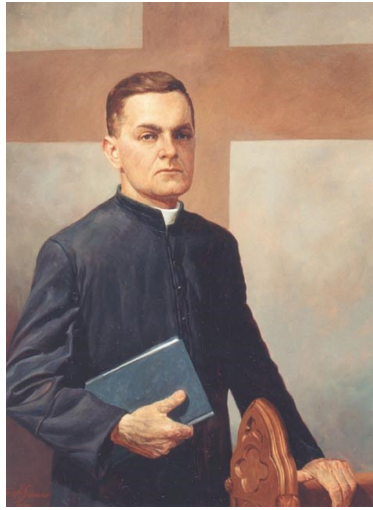
Father McGivney Pray for Us

Meetings are held on the 1st and 3rd Tuesdays of each month in the Council Hall located at the intersection of Morton Street and Garity Place. The mailing address is 1 Morton Street, Farmingdale, NY 11735-4340. The deadline for material for publication in the Mariner is the Friday that follows the 3rd Wednesday of the prior month. PLEASE keep this deadline in mind for articles you wish to have publish in the Mariner.