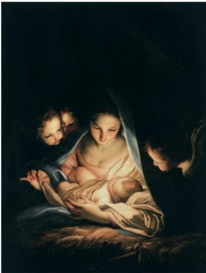
The Holy Night (The Nativity) By Carlo Maratti (1650s) Gemäldegalerie, Dresden