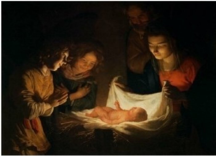
Adoration of the Child By Gerrit van Honthorst (c. 1620) Galleria degli Uffizi, Florence

“The light shines in the darkness and the darkness has not overcome it” (John 1:5)