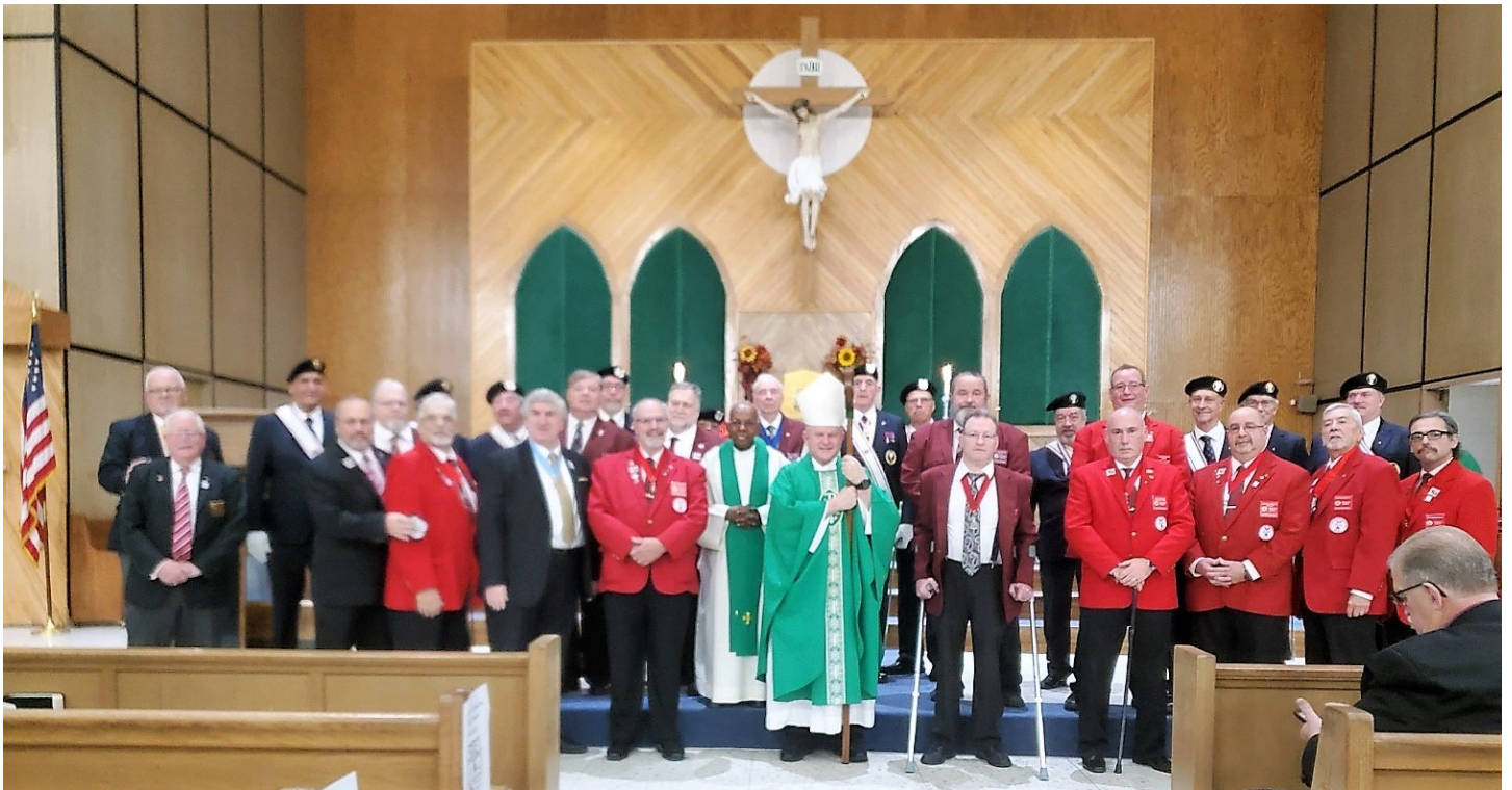
SUFFOLK CHAPTER KofC Installation and Memorial Mass 2021

More information will be available at the next meeting.